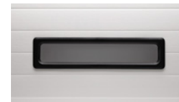
24" X 6" DOUBLE INSULATED ACRYLIC WINDOWS WITH BLACK FRAME