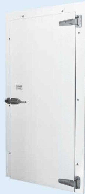
Cooler Door Shown Right Hand Swing