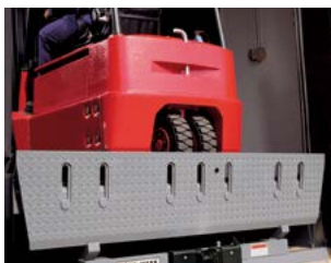
Rugged steel Safe-T-Lip® barrier helps address drop-off accidents.

The totally enclosed motor is rated at 110V, 60Hz, single phase. All operator controls are mounted in a gasketed, NEMA 12 enclosure. All electrical components, connections and wiring are UL listed or recognized. Please Note: Unless specifically noted on quotation, all electrical including hook-up is the responsibility of others.