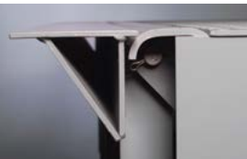
Constant radius rear hinge