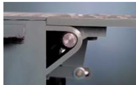
Two-point crown control