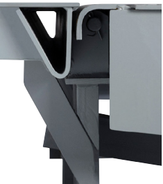
Constant radius rear hinge