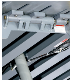
Two-point crown control