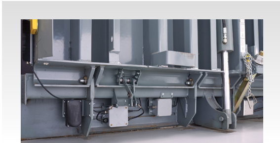
Safe-T-Pit™ (patent pending)