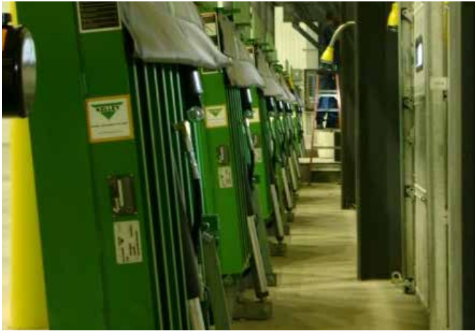
Shelf Installations: The Easy Way.

Kelley's Vertical Dock Leveler can be safely installed either on a shelf or in a pit. Both installations provide the same energy efficiencies and ease of maintenance. So with either choice, the energy savings alone means a positive return on your investment in a short time.