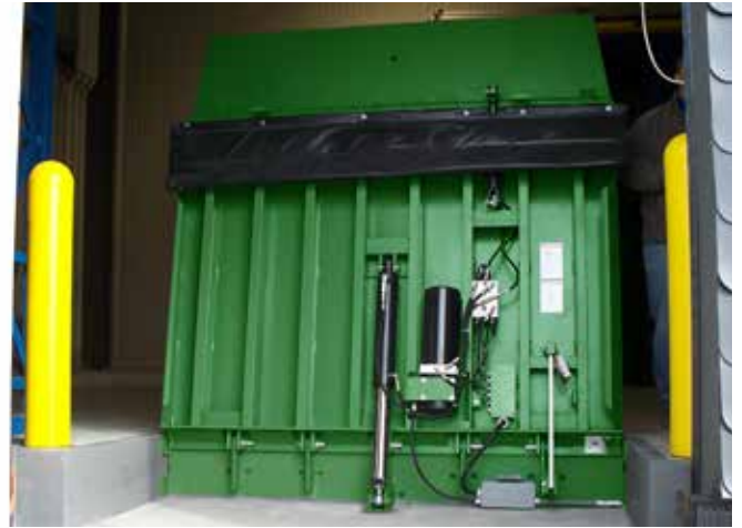
Pit Installations Give You The Most, Take Away The Least.

In pit-style installations, each Kelley Vertical Dock Leveler is mounted at the back of a rectangular pit behind the insulated doors, leaving the pit floor accessible for quick and easy access for routine inspection, housekeeping and maintenance.